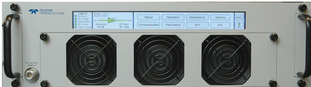
3RU SSPA Chassis with Touchscreen Display

Teledyne Paradise Datacom's Indoor 3RU Solid State Power Amplifiers represent the latest in High Power Microwave Amplifier Technology. The SSPA chassis achieves the highest power density in the industry along with enhanced maintainability.