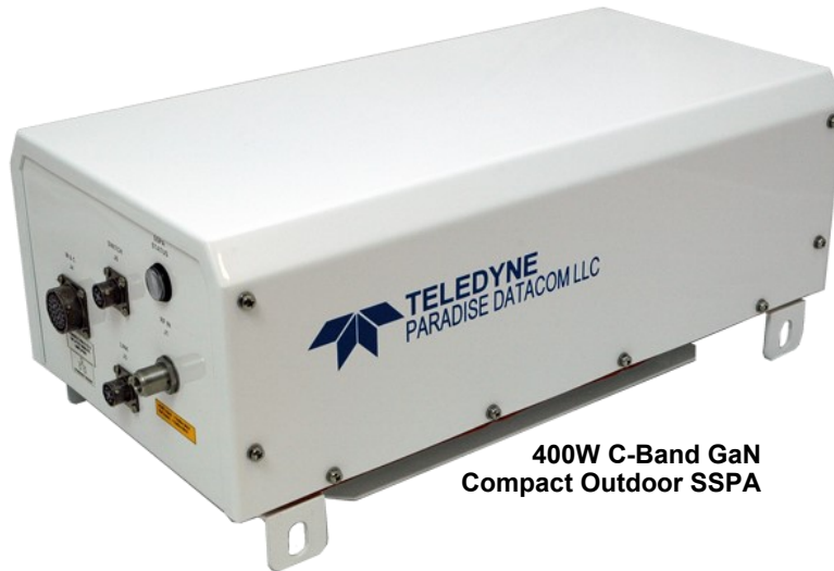
400W C-Band GaN Compact Outdoor SSPA