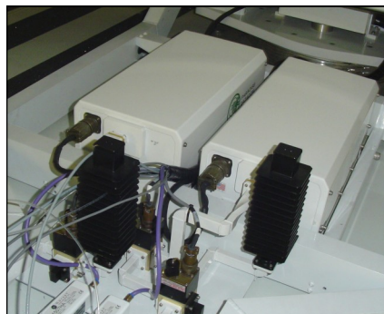
SNG-mount 1:1 system w/ side-mount AC input