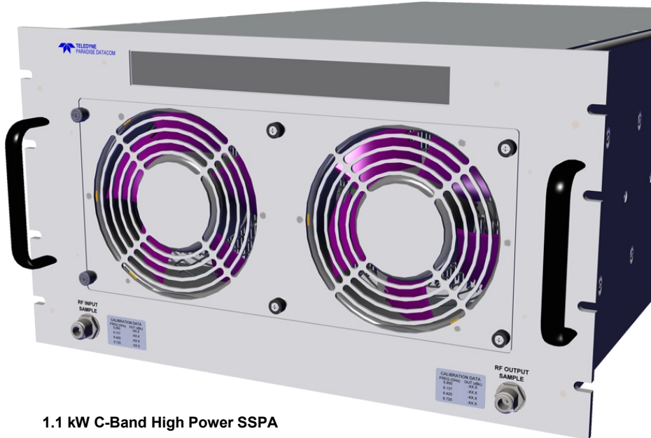
1.1 kW C-Band High Power SSPA