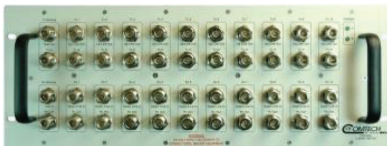
CRS280 or CRS-280L