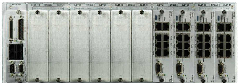
Data Switch Unit (DSU), Front View