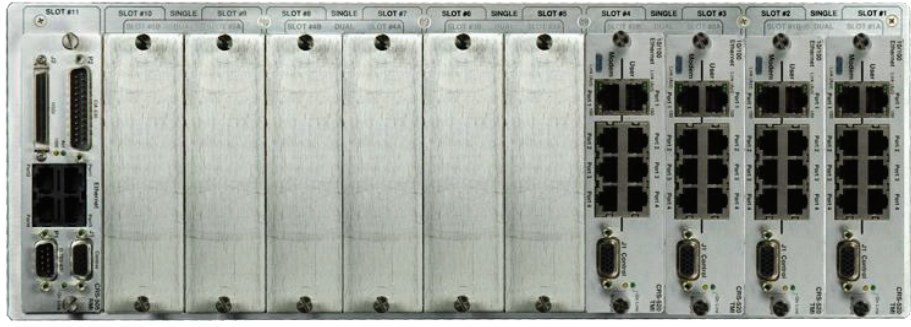
Data Switch Unit (DSU), Front View