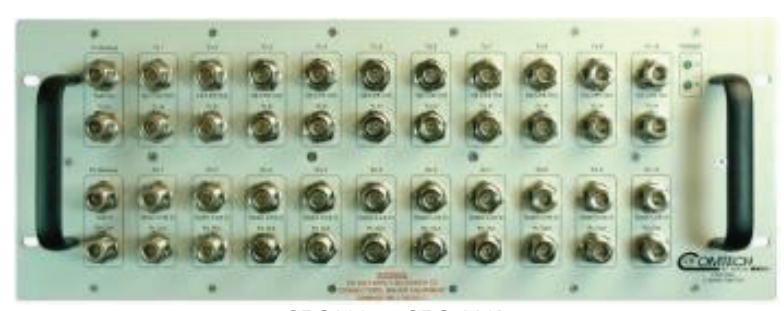
CRS280 or CRS-280L