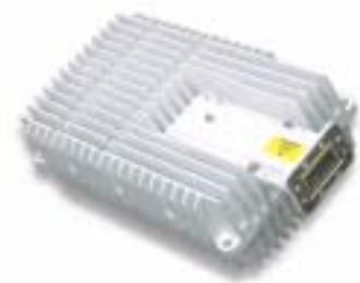
C-Band Low power Block Up Converter

The BUCs are completely protected from the elements, are without external user controls, and are fully sealed and pressure tested to 34 kPa (5 psi). Particle and moisture penetration is rated to IP67. High quality paint is used to protect the modules from corrosion.