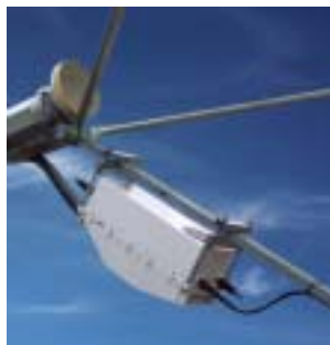
C-Band Medium power Block Up Converter

and a warranty of three years on manufacturing, design or component defects.